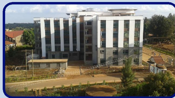
The Chuka University Business & Students' Recreation Centre